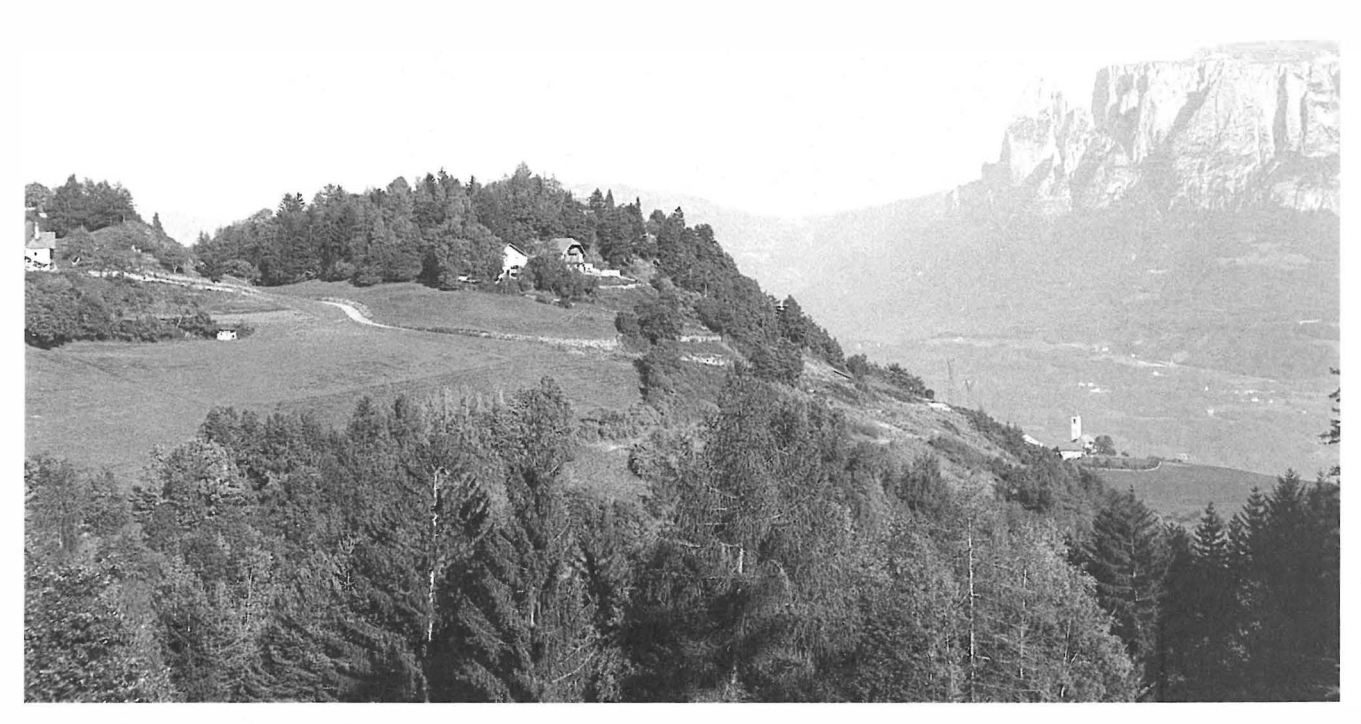
Fig. 1 - Colle Piper from the South

Perini R., 1969 - Risultato degli scavi eseguiti nel 1965 e 1966 ai Montesei di Serso. Studi Trentini di Scienze Storiche B,46,2: 207, Fig. 9